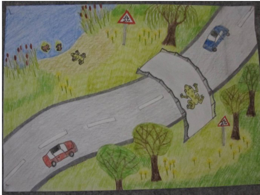
Fig. 2. Runner up of the "On Dangerous Roads" Competition organized by Varangy Akciócsoport Egyesület for the 2010 Infra-Eco Network of Europe Conference showing an overpass used by wildlife. An ongoing project in the Netherlands is studying the effectiveness of an overpass for amphibians, in combination with fences along the road. This overpass is equipped with a cascading series of small ponds fed with water pumped into the highest pond in the center of the overpass.

suitable habitat for small mammals. Only 2 of 13 species of small mammals were never captured near roads, and the remaining 11 species' numbers were either similar or more abundant near the road than further away.